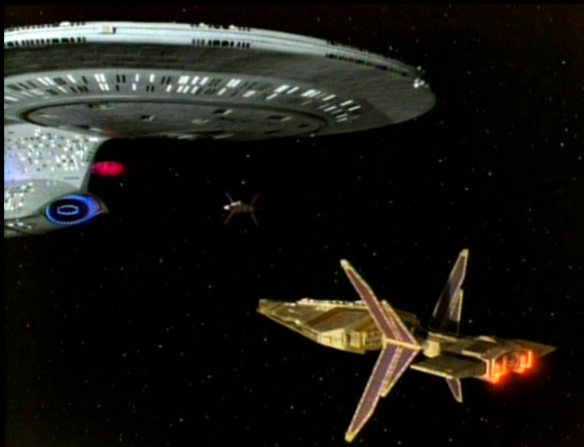
The Q'Maire confronts the Enterprise-D