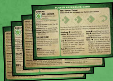
4 Player Reference Cards