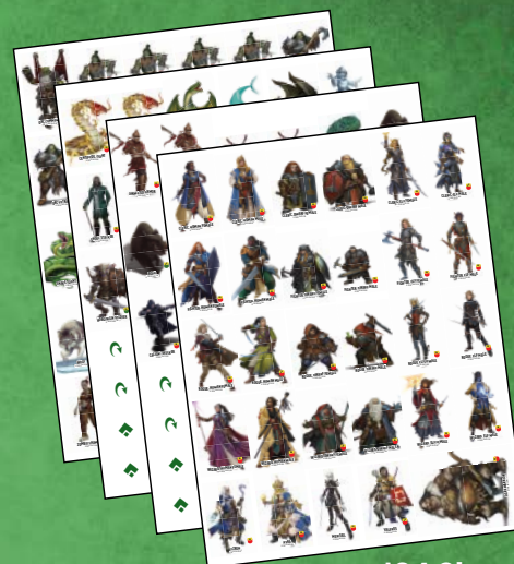
124 Character and Monster Pawns (plus 4 sets of action tokens)