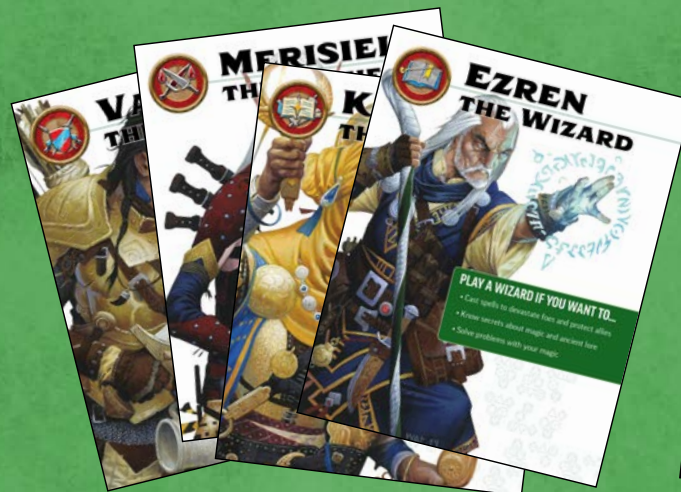
4 Pregelenerated Character Sheets