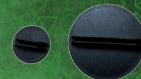
13 Plastic Pawn Bases (including 1 large base)