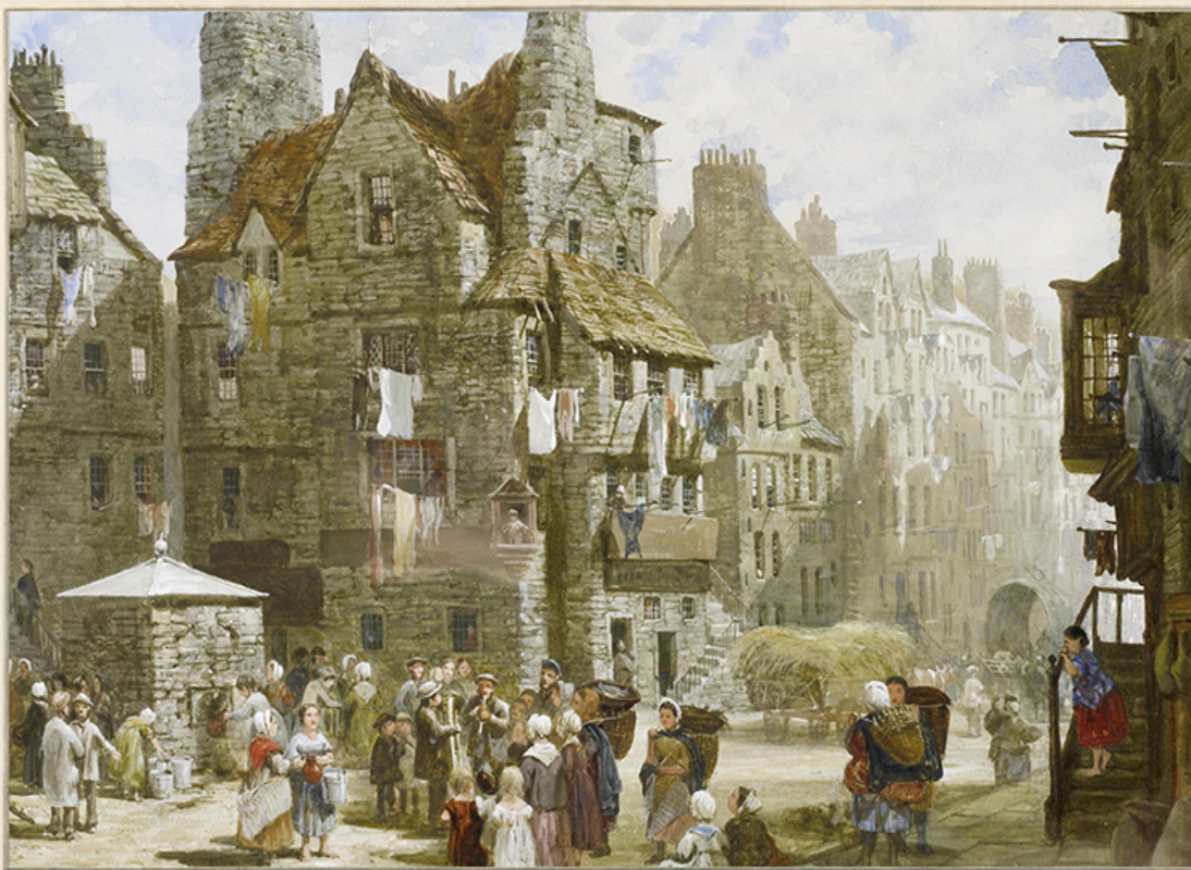
WATERDEEP'S SOUTH WARD

The soldiers stationed at East Torch Tower suspect that a vengeful spirit or ghost is responsible for the strange occurrences. At first, commander Artun disregarded these rumors as mere superstition. However, after 3 of his guards were seriously wounded he is taking the matter more seriously. Artun suspects foul play, but an internal investigation came up with nothing. The culprit is a possessed guard named Brennan, and a character with a passive Wisdom (Insight) of 14 or higher notices his suspect behavior and inconsistencies in his story. Brennan, who can enter and leave the tower as he pleases, poisons the rations as well as other utensils whenever he sees an opportunity. The vengeful ghost (MM 147) who possesses Brennan is that of Jeremy Mon, a man driven to suicide by his comrades. Jeremy's spirit passes into the afterlife peacefully when his former comrades at East Torch Tower apologize to him at his grave in the Field of the Dead. Otherwise Jeremy only finds rest after all the guards who tormented him are dead.