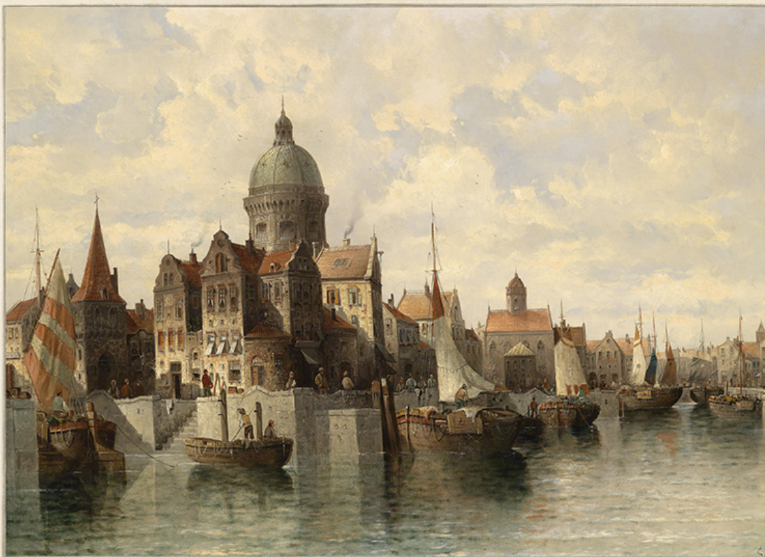
WATERDEEP'S DOCK WARD

There is great cause for concern. The relationship between Waterdeep and Luskan is at an all-time low, and this incident could lead to a full-scale war. Currently, the Waterdhavian diplomats are working tirelessly to pacify their Luskaran counterparts. Captain Kolden is sure that the flag was stolen by an enemy agent to justify a war. In reality, a pair of drunk students stole the flag, which now flies in the students' humble abode in the South Ward. One of the students, named Icarium (CN male half-elf apprentice wizard VGTM 209), stole a potion of flying from a tutor's office and used it to swipe the flag directly from the pole. An old man who needed to relieve himself saw the flying student in his school uniform of the Watchful Order of Magists and Protectors, but nobody believes him since he is senile.