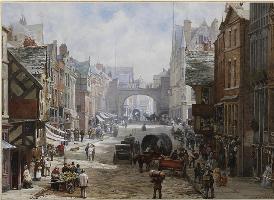
WATERDEEP'S TRADES WARD

Killian (LN male human guard MM 347) is an honest and concerned citizen, who is planning an unauthorized sting operation on a drug den called Dankmire in the South Ward. He has assembled a handful of reliable fighters who will support him. The Dankmire is a true hornets' nest. 20 drugged bandits (MM 343) hide in secret rooms beneath the Dankmire and defend the joint to the last man. After the dust has settled, the city guard appears and attempts to arrest the remaining combatants. The characters can prevent an arrest by succeeding on a DC 15 Charisma (Persuasion) check .