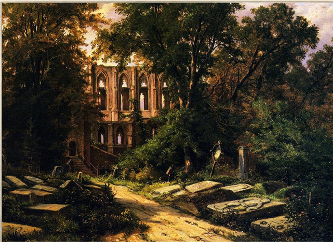
CITY OF THE DEAD

The official note on the board is just a pretext to recruit help in a more serious matter. Once the characters arrive, Director Gloin Gloinson informs them about the real problem: a person is cooking the books and embezzling parts of the gem shipments arriving to the city. The culprit can only be a disgruntled employee working in the guild hall, since no one else has access to the books. Gloinson tasks the characters to act as simple guards while covertly searching the guildhall for clues. The person responsible is Gloinson's new wife, Ebba (NE female elf mage MM 347), who is a secret agent of Xanathar's Thieves' Guild. She uses spells such as suggestion and modify memory on Gloinson to divert the shipments in question. The modify memory spell replaces the mage's cone of cold spell.