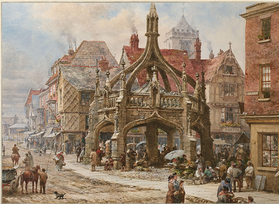
WATERDEEP'S SEA WARD

Patrician Dollin Vorman tasks the characters to travel to the Sword Mountains and dispose of the rabble that seized the Order's mine. In actuality, the mineworkers and their families occupied the silver mine. The Order ignored the miners' petition for higher wages and insurance against death, which led to the violent uprising. The Order's foreman and assessor were killed during the change in leadership, which escalated the situation. The characters can achieve a temporary peaceful solution by negotiating with the leader, Brennan Dorn (CG male human veteran MM 350). Brennan demands that the characters either mediate or return with a person that can negotiate on the Order's behalf. A character who succeeds in a DC 15 Charisma (Persuasion) check can convince the strikers to vacate the mine if the characters agree to Brennan's terms.