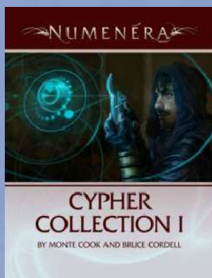
Cypher Collection 1