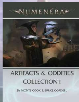
Artifacts & Oddities Collection 1