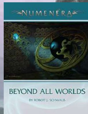
Beyond all Worlds

All Numenera Glimmers are also available on DriveThruRPG .