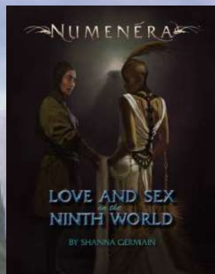
Love and Sex in the Ninth World