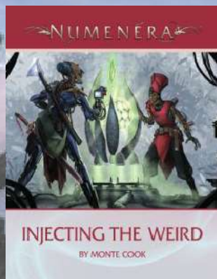
Injecting the Weird