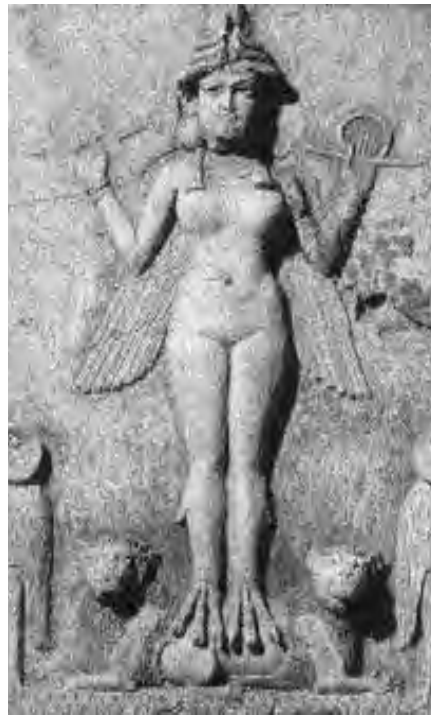
A relief of the goddess Inanna.

The Sumerian gods were very human in their behavior, falling in love, giving birth to children, fighting, arguing, and murdering each other. Despite their human foibles, the gods were considered immortal and all-powerful. Humans were nothing more than servants of the gods and lived at their whim. To keep the gods happy, the people built huge, pyramid-shaped temples (ziggurats) in each city-state. Here they would offer various sacrifices to appease these fickle beings.